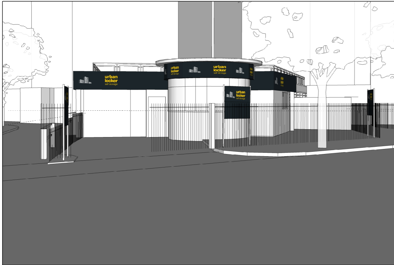
STREET VIEW FROM SOUTH