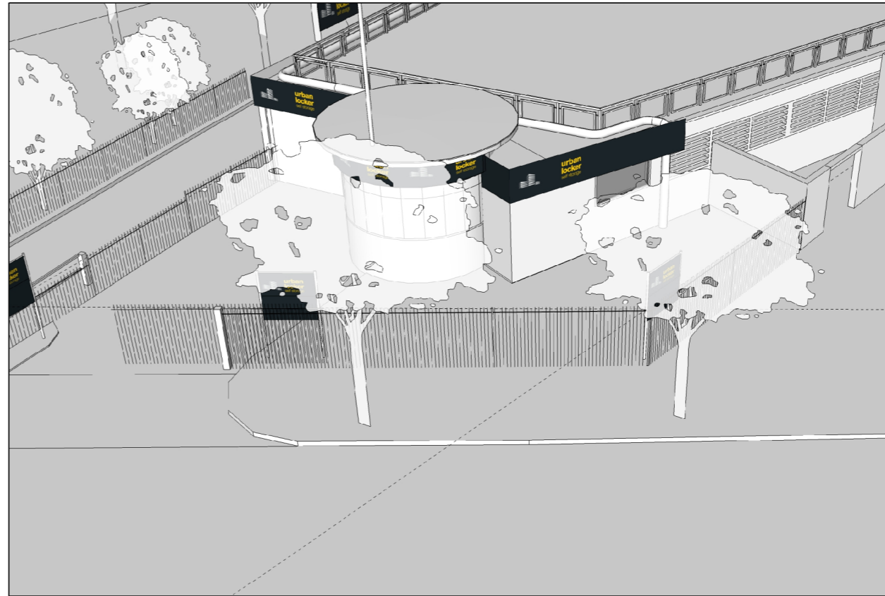
AERIAL VIEW FROM SOUTH